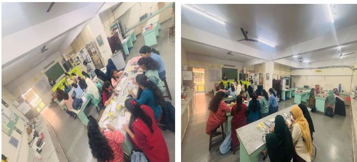
Fevicryl painting session in progress

The club also organized a Fevicryl pouch painting workshop on November 15 th 2024 to boost creativity and to give an opportunity to the participants to learn new skills and artistic methods. Almost 20 students took part in this event and exhibited their talents and skills which promoted self-confidence and technical abilities.