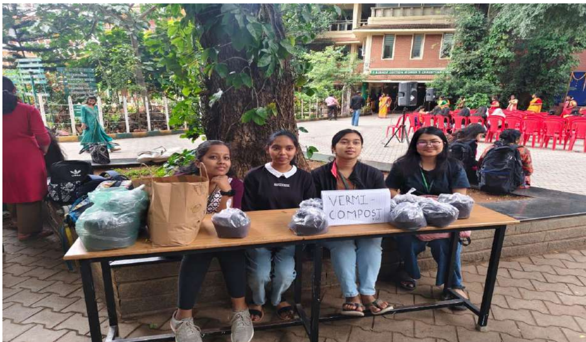
Vermicompost sale in the campus