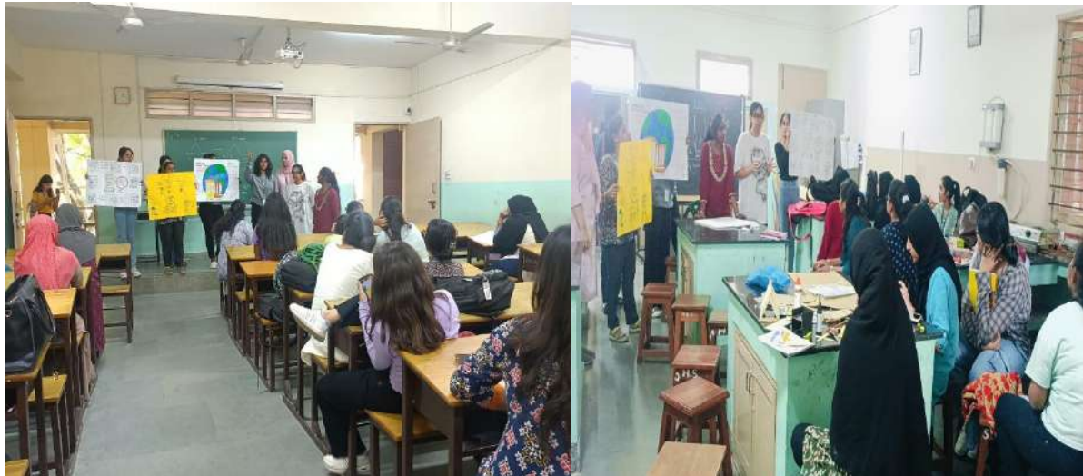
Clean drive organized by the Eco-watch Club

Clean drive was organized on November 12 th 2024 to create awareness about cleanliness and energy conservation in the classrooms. Students also emphasized on reducing plastic wastes and segregation of wastes in the campus. They explained about biodegradable and non-degradable wastes and how proper segregation also prevents contamination of recyclables and minimizes the amount of waste sent to landfills.