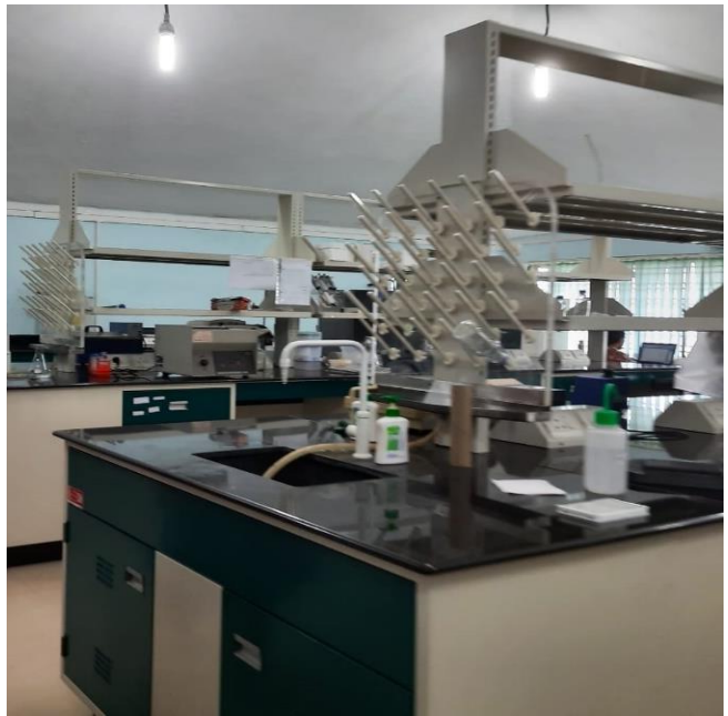
MOLECULAR BIO SCIENCES LAB

3. SURABHI : -Treatment for various issues and problems are given .The students were guided through the rooms containing the Sauna to alleviate muscle soreness and tension, Mud therapy rooms which helps invigorate, refresh and vitalize the body it absorbs toxic substances from the body.