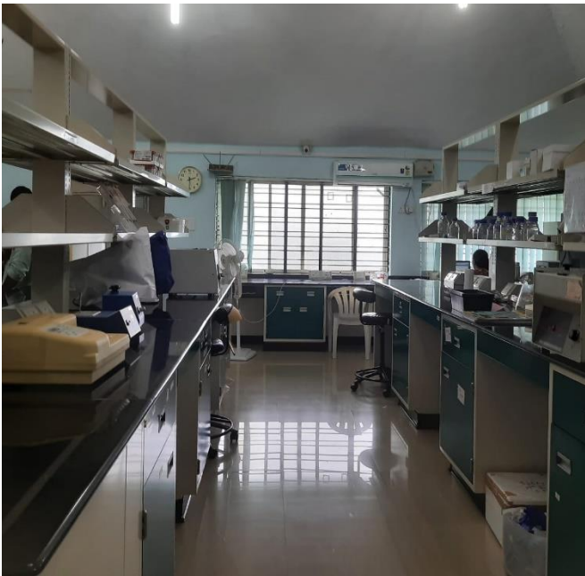
CLINICAL PSYCHOLOGY LAB