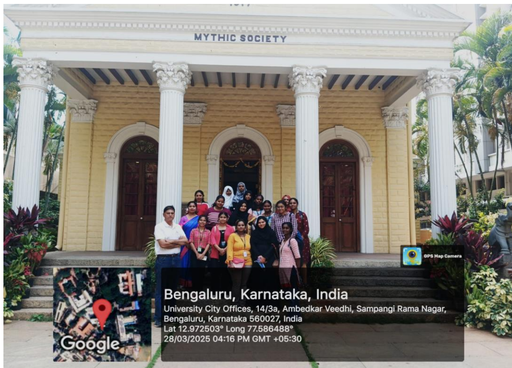
The heritage building of Mythic Society founded in 1909